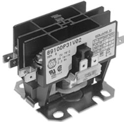
Type DP31V02 1-Pole