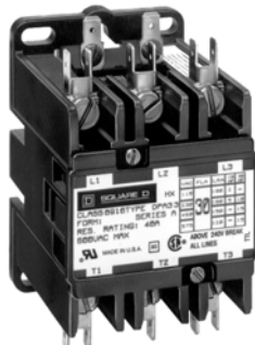
Type DPA33V02 3-Pole