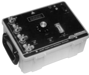
The Low-Range DLRO, Cat. No. 247002, features an extra range and rugged, Single-Pak design.